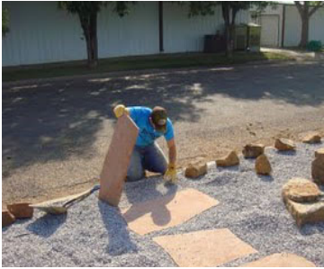
Be a Community Volunteer