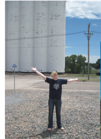
Find Your Voice