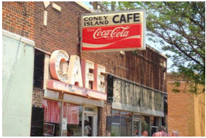
Discover Your Place