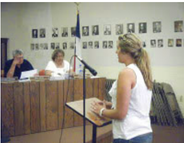
Revitalize the Community

OC Community Internships offer experiences that highlight the assets as well as the difficulties faced by rural communities and urban neighborhoods. These internships provide one of the best possibilities for communities to connect with and inspire youth and adults to "return home" to live, work, play, and raise their families.