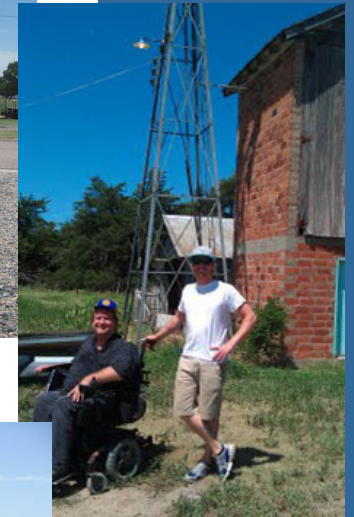
Learn & Share Stories