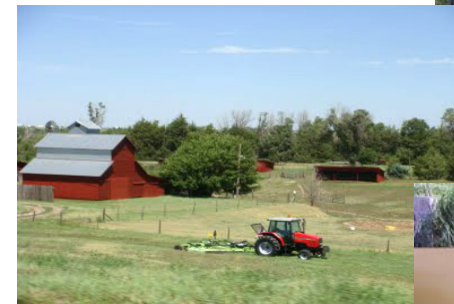
Steward Natural Resources