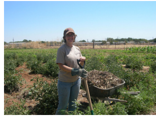
Support Local Food